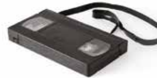
Photo slideshows Audio tape to CD/MP3 DVD to MP4

Don't lose those precious moments! VHS to DVD Conversion